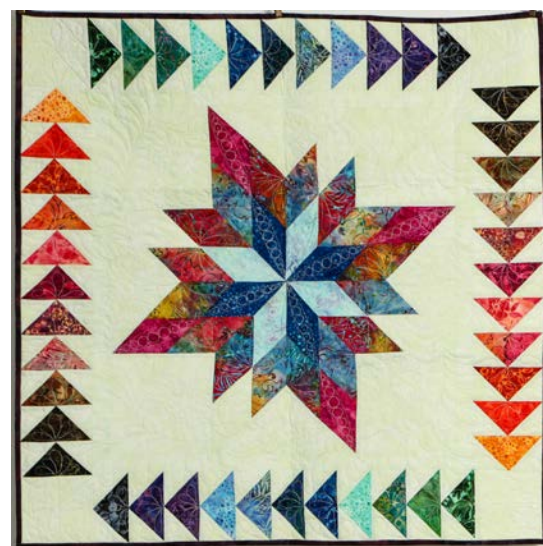
Quilt size: 30" x 30" Skill level: Intermediate