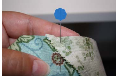
Step 3 Pin should be perpendicular to straight edges of diamond units