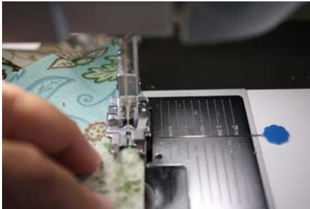
Step 4 Stitch to pin and remove when needle is one or two stitches away. Aim needle for hole left by pin