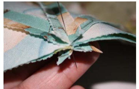
Step 21 Use straight pin and position in seams exactly one quarter inch in both top and bottom halves