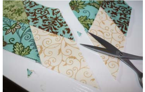
Step 6 Trim dog ears from diamond pair units