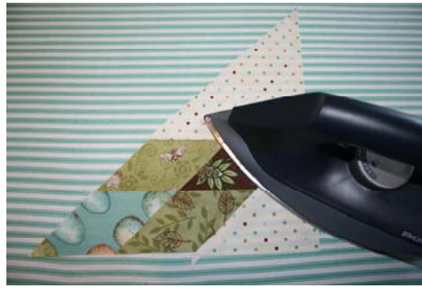
Step 14 Press seam of Triangle B away from diamond wedge