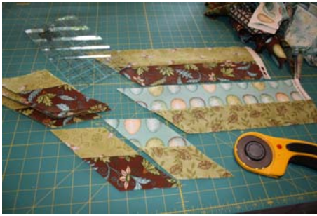
Step 1 Cut diamond pairs from strip units