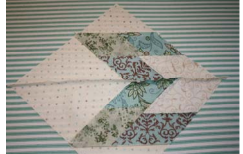
Step 18 After stitching diamond wedges together, press seams OPEN