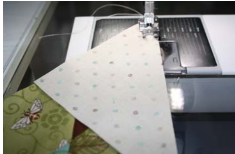
Step 8 Starting at point, sew a scant quarter inch from matched edges