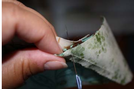
Step 2 Match seams using a pin through both seams exactly one quarter inch from straight edges