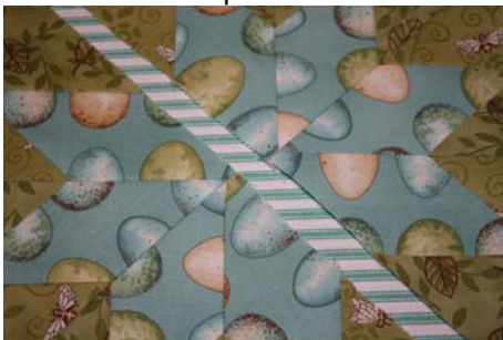
Step 19 Stitch two squares together to create half of block. Press all seams OPEN