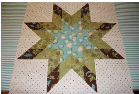
Step 22 Trim remaining dog ears, being careful to leave a quarter inch seam allowance for star points