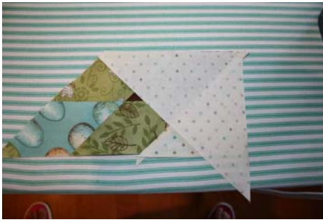
Step 13 Match two sides, leaving dog ear to extend beyond matched edges