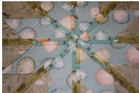
Step 20 After joining quilt halves together, be sure to press seam open as shown