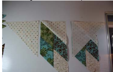
Step 12 Place Triangle B rst on top of diamond unit and line up straight edges with Triangle A