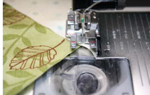
Step 9 End stitching of apex of background triangles and diamond pairs