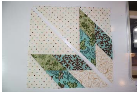
Step 17 Match points of diamonds and use pins in seams to secure