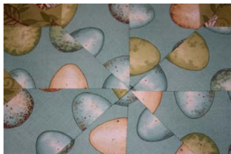
Step 23 You will have a perfect point that lies completely flat!