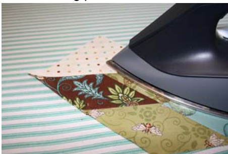
Step 10 Press seam of Triangle A away from diamond unit