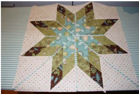
Step 16 After constructing diamond wedges, join two wedges together to create squares