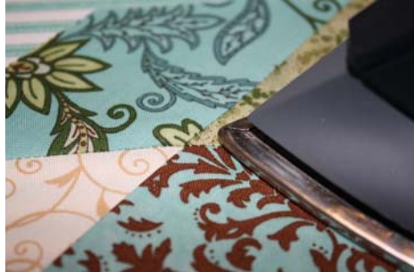
Step 5 Press seam to one side. Point where diamond pairs meet will be perfect!