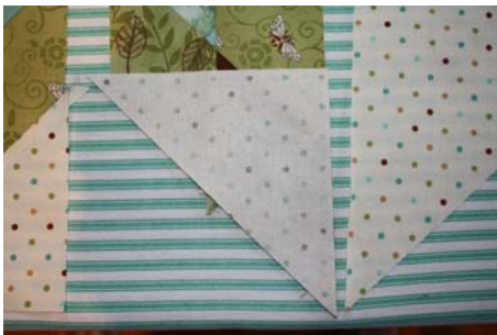
Step 7 Place Triangle A rst on diamond unit matching point and two sides