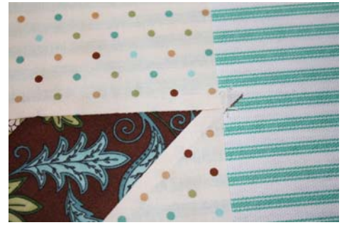
Step 15 Do not trim dog ear after adding Triangles A and B until block is completely constructed