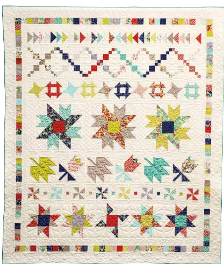
PLEASANTVILLE, 76" x 88", by Kimberly Einmo. Quilted by Carolyn Archer, Ohio Star Quilting. Fabrics from Hometown Girl by Pat Sloan for Moda Fabrics.

Easy SKILL 76" x 88" finished SIZE Various BLOCK