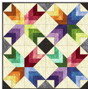
28" x 28" as shown