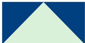
Flying Geese units

Number of A and B triangles cut from one strip of fabric (based on 40" strip)